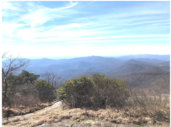
View from Blood Mountain

Looking ahead, we have started signups for our week of Scout camp at Camp Rainey Mountain this summer, and are making progress planning the 2020 summer adventure to Yellowstone and Grand Tetons. In March, the troop will camp at Scoutland and work on canoeing and camping skills on Lake Lanier.