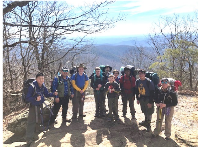
The troop on the Appalachian Trail