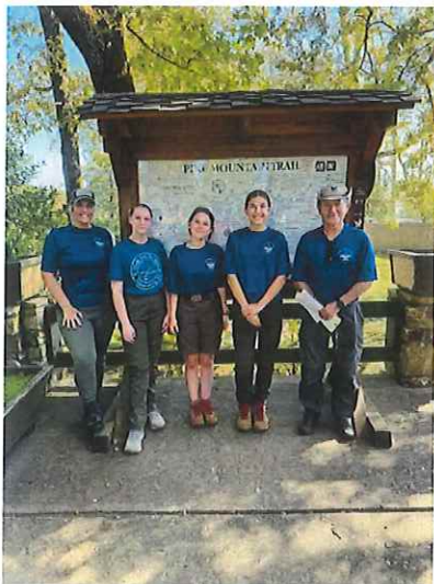
Troop 5149 ready to hike