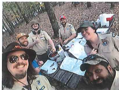
Adult leaders training together