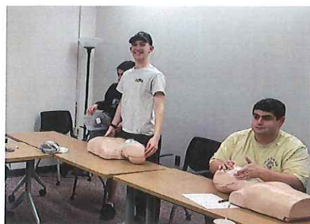
Scouts learn CPR