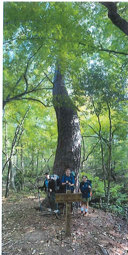
Scouts on the trail