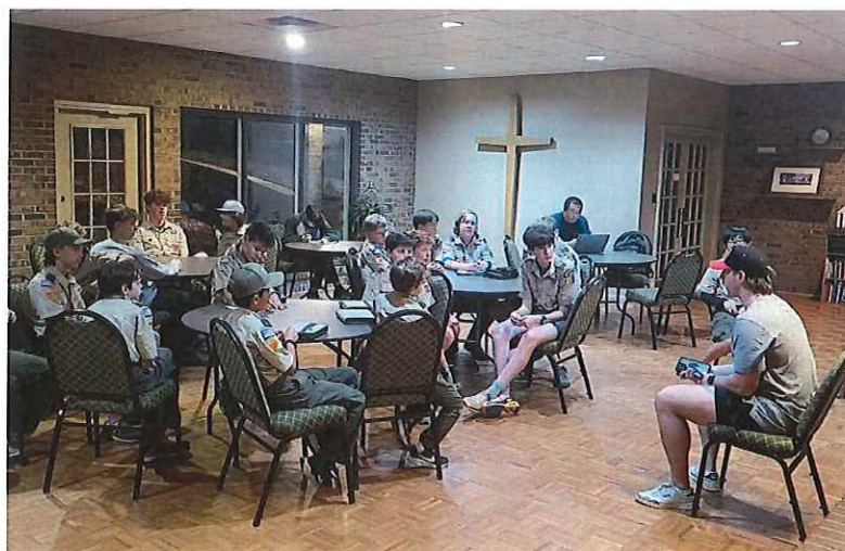
Hike planning and gear review