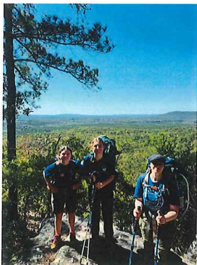
Troop 5149 on Pine Mountain