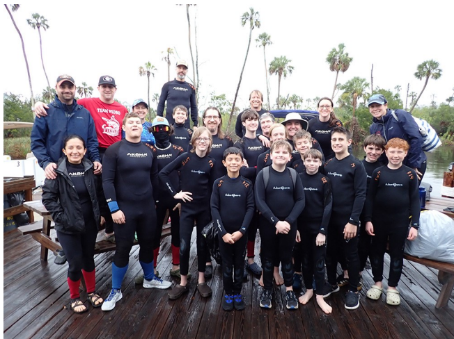
Troop 149 Snorkeling