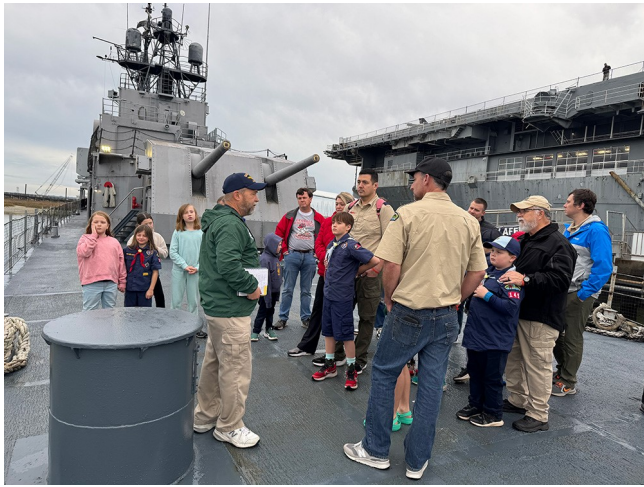
Pack 149 on the USS Laffey