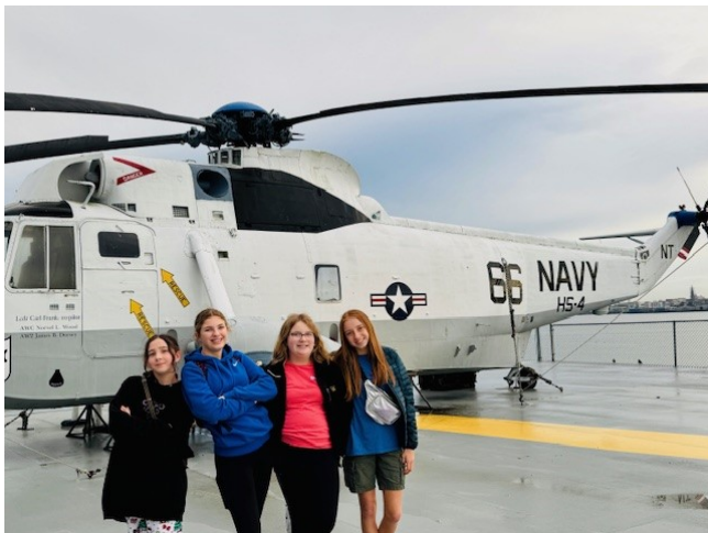
Troop 5149 Girls