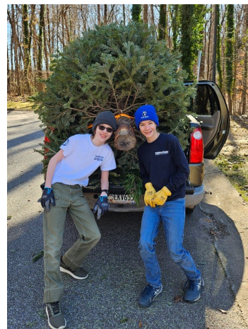
Scouts gathering Christmas trees