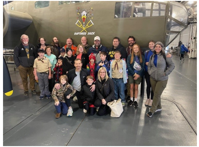
Pack 149 with Troop 5149 at Patriot's Point